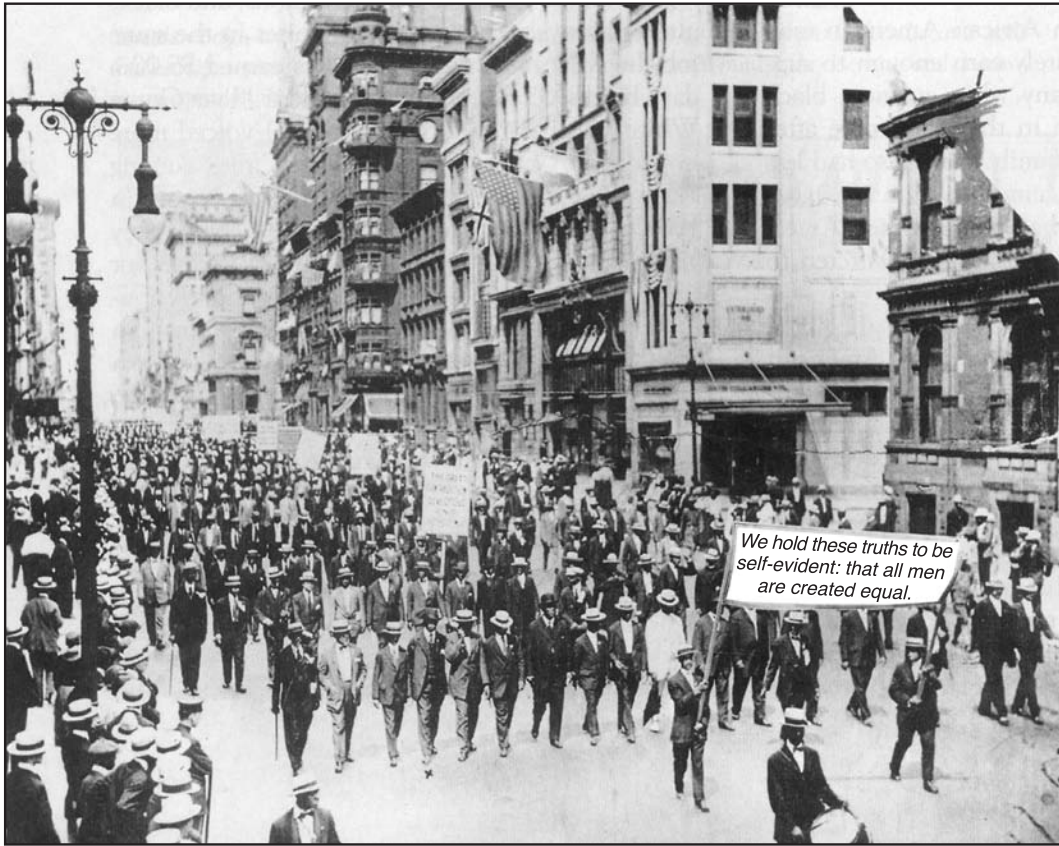
Parade in New York City sponsored by the NAACP in 1917