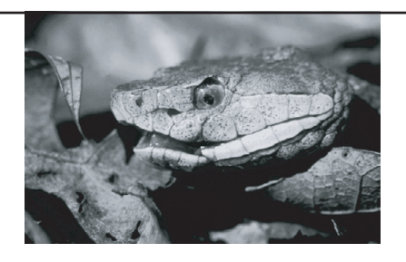
A copperhead snake has poison in its fangs.