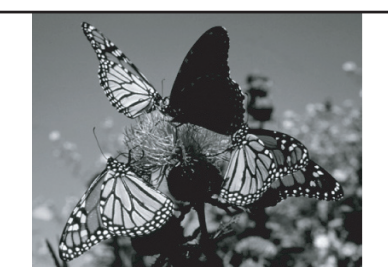
The Monarch butterfly's colors warn predators to stay away.

Predators may be strong and have keen eyes and sharp claws and teeth. But nature has given their prey different ways to hide or fight back. Most animals, even very small ones, are not totally helpless. Whether they are hiding, fighting, or spitting poison, animals that are prey can make the hunt very difficult for a hungry predator.