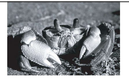
This crab's hard shell is its skeleton.