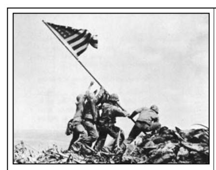
United States marines raised the flag at Iwo Jima (a famous battle) during World War II, 1945.

Raising our flag is a symbol of our country and our freedom. The flag has been raised in battle, at events symbolizing our accomplishments, and lowered during times of great sadness. It reminds us of the sacrifices and achievements many people have made for our country.