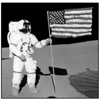
Apollo 14 Commander Alan Shepard placed the United States flag on the moon in February 1971.