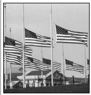
Flags are flown at half-staff to honor someone who has died, such as an American president.