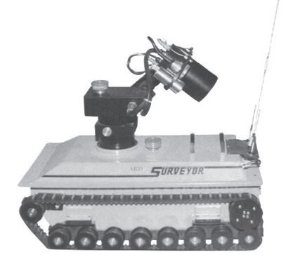
An early mobile robot