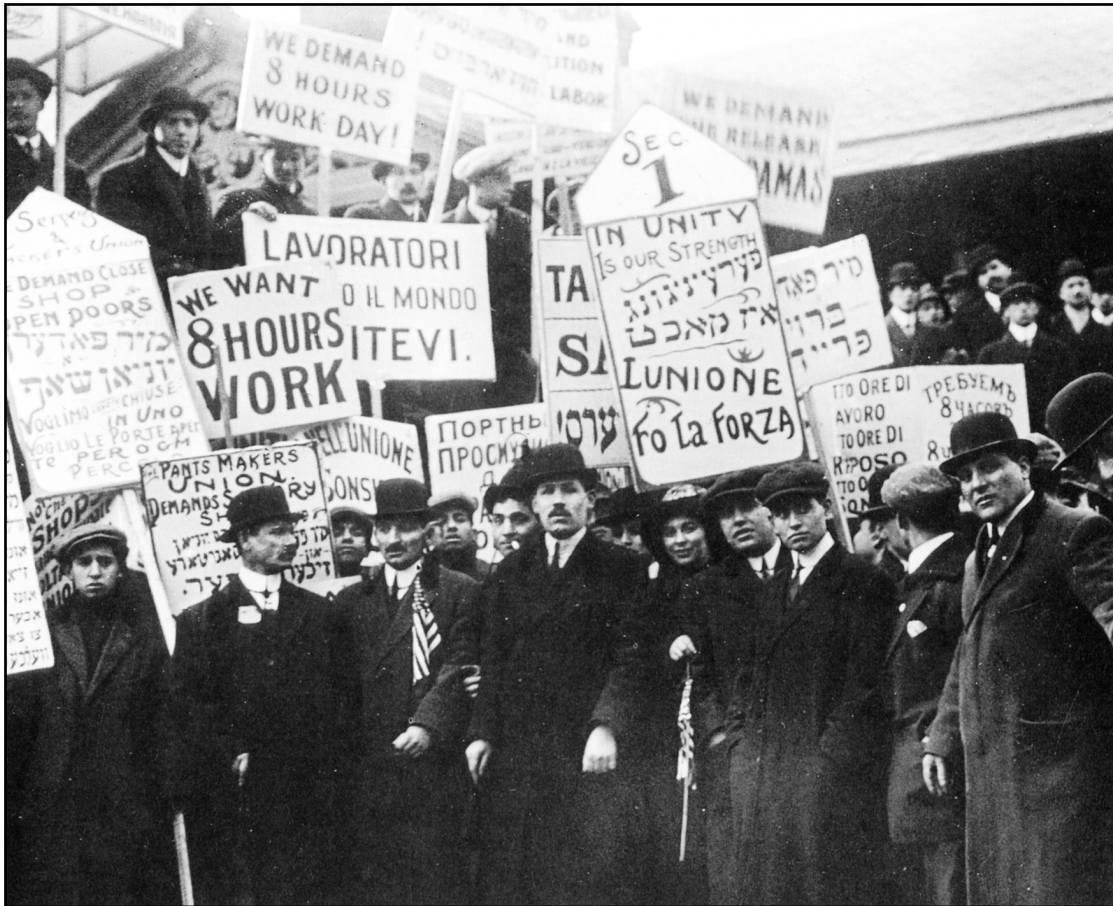
Source: Historical Atlas of the United States , National Geographic Society, 1988

Question 6 Based on this photograph, identify one goal of this protest by immigrant workers.