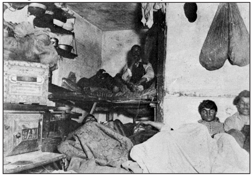
In the Home of a Ragpicker, New York City — 1890