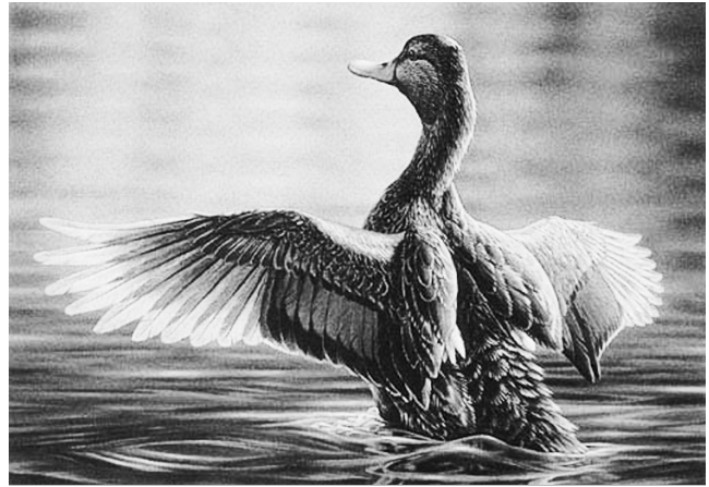
Adam's winning work of art—a mottled duck

Federal Migratory Bird Hunting and Conservation Stamps are commonly called "Duck Stamps." These pictorial stamps are produced by the U.S. Postal Service for the U.S. Fish and Wildlife Service; however, they are not valid for use as postage. Each waterfowl hunter is required to purchase a stamp and carry it along with a hunting license.